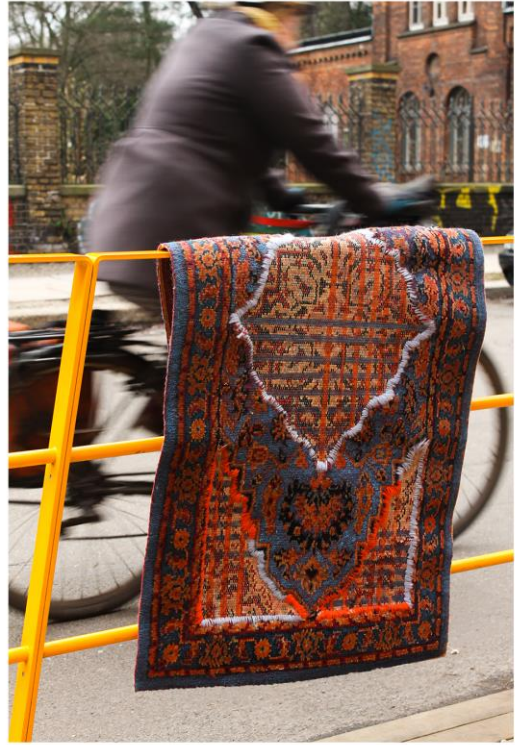
'Back to the street' Photoshoot